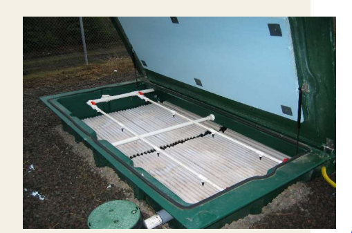
View of Inside of Advantex Module