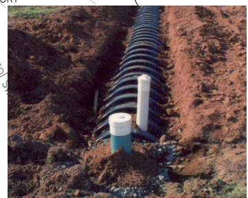
Maintenance & Inspection Ports