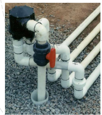
Automatic Distributing Valve