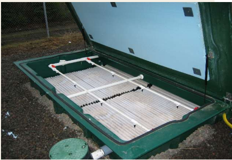
View of Inside of Advantex Module