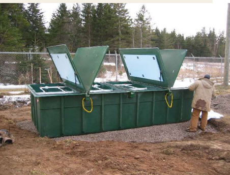
Advantex Textile Filter Module Before Installation