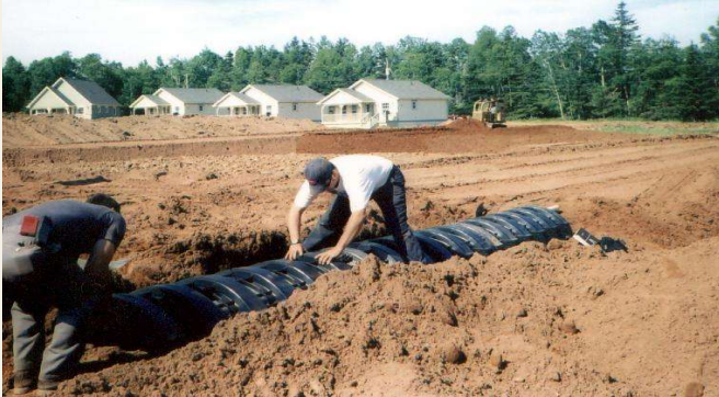
Installing Leaching Chamber Disposal Field

Brudenell Fairway Chalets Roseneath, Prince Edward Island Client: Mar-Wood Properties